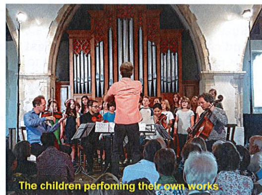
The children performing their own works

An experienced music educator and a professional chamber ensemble worked alongside the children to write original lyrics, create new melodic material, rehearse and perform their pieces. "The Friday education concert (including Britten and Ravel), performed by professional musicians, brought live classical music to children (and their families) who may not otherwise experienced it. In addition, the opportunity to perform music their own compositions, alongside professional performers, is a unique experience that will give the children an experience that can be carried through to other areas of their school/work and home lives.