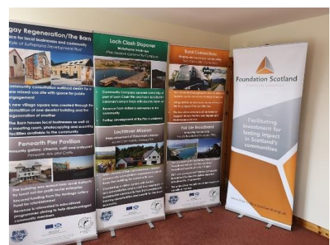
Image right: Foundation Scotland sharing a platform with the Kyle of Sutherland Development Trust as part of the community consultation event.